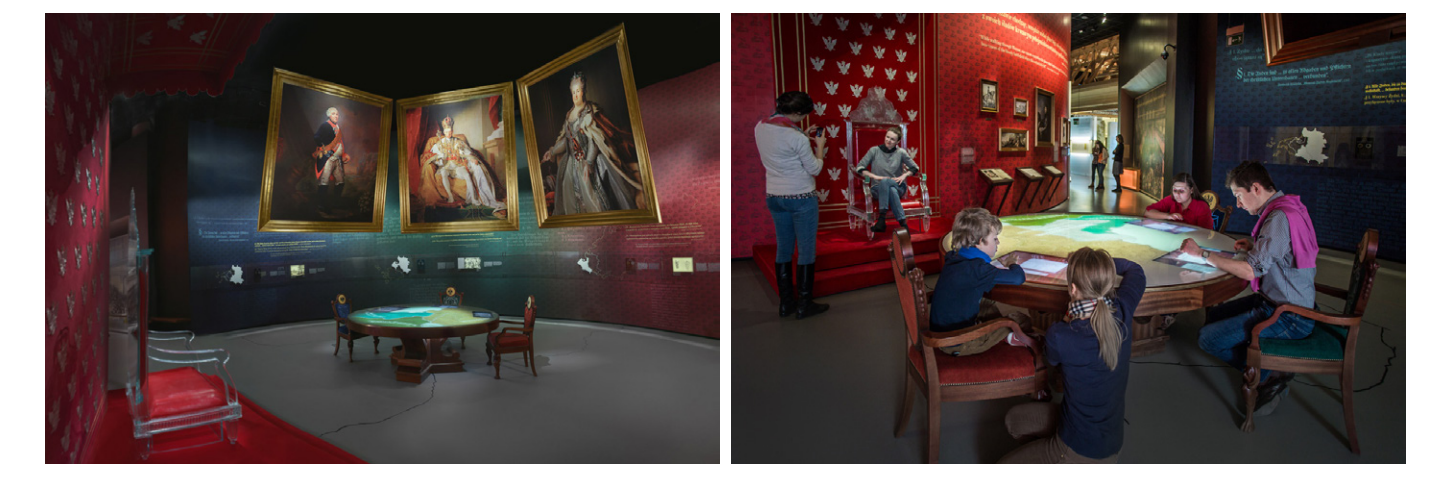
Gallery 5: Encounters with Modernity, 1772–1914

The rulers of Prussia, Austria and Russia look down from their massive portraits on the empty throne of the last Polish king. Between 1772 and 1795, they partitioned the Polish-Lithuanian Commonwealth, which disappeared from the map, and inherited the Jews living there. Jews are now individual subjects of absolutist monarchs. Sit at a throne and explore the laws that now regulate many details of their everyday life, while surrounded by maps illustrating a geopolitical reality that will last until the First World War.